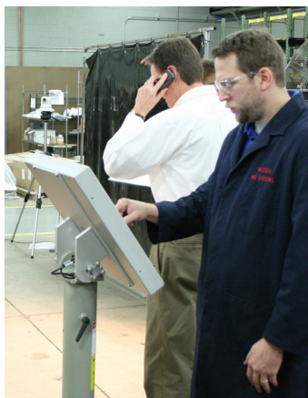
Live demonstration in process.