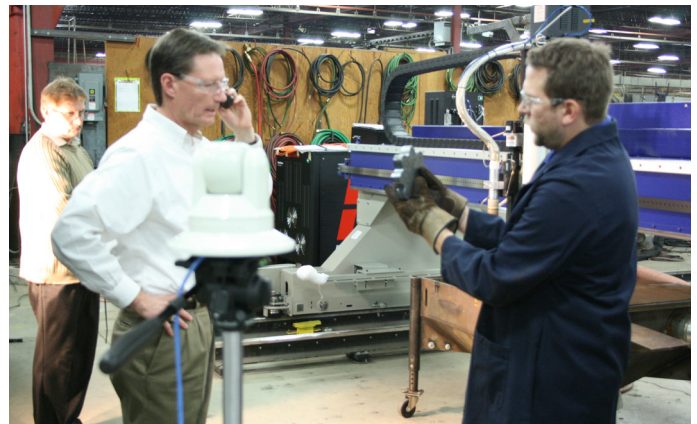
Live demonstration showing the cut material.